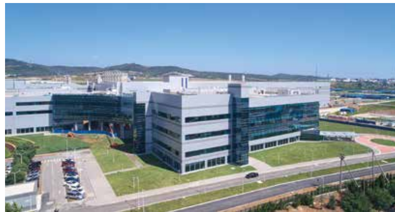
Confidential Client 300mm Wafer Fab China 2016 - ongoing Design/Build & Tool Install

This is what customer satisfaction looks like