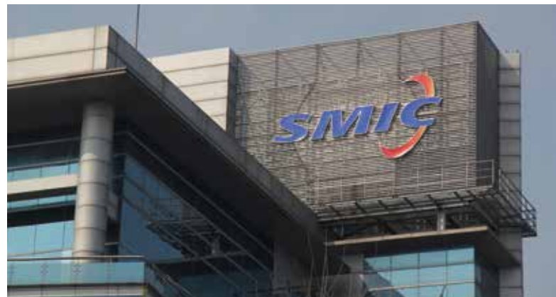
SMIC 300mm Wafer Foundry Beijing, China 2014 - ongoing Extended Cleanroom EPC

This is what customer satisfaction looks like