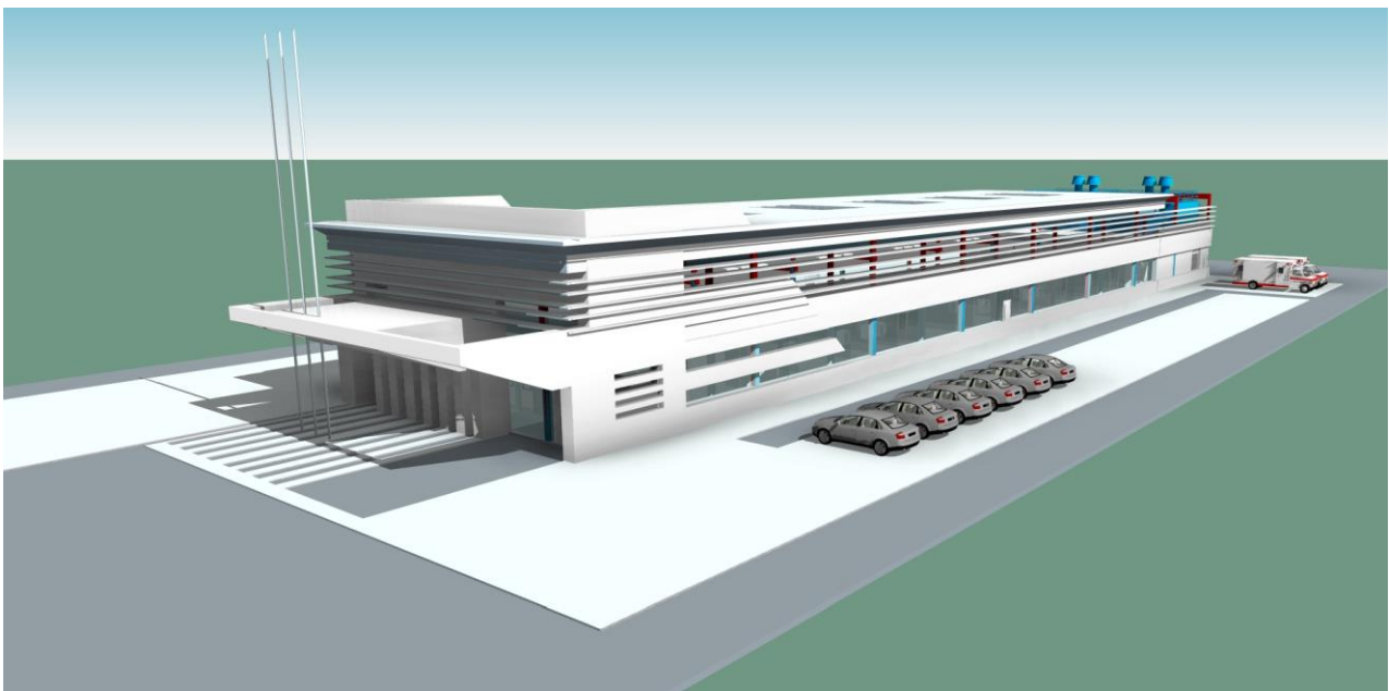
2 EXYTE_VACCINE PRODUCTION PLANT_TOP VIEW